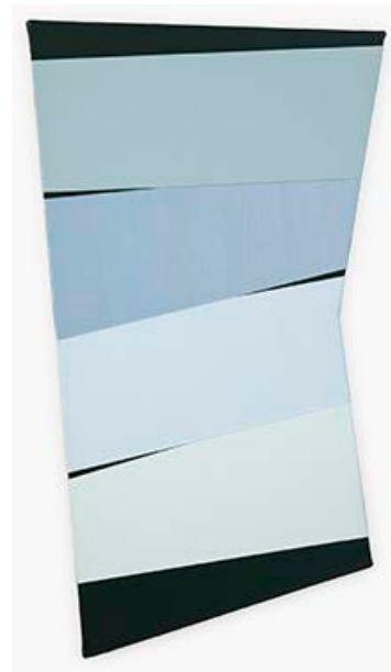
Li Trincere, Blueband2 , 2018, Acrylic on canvas 34 x 18 "